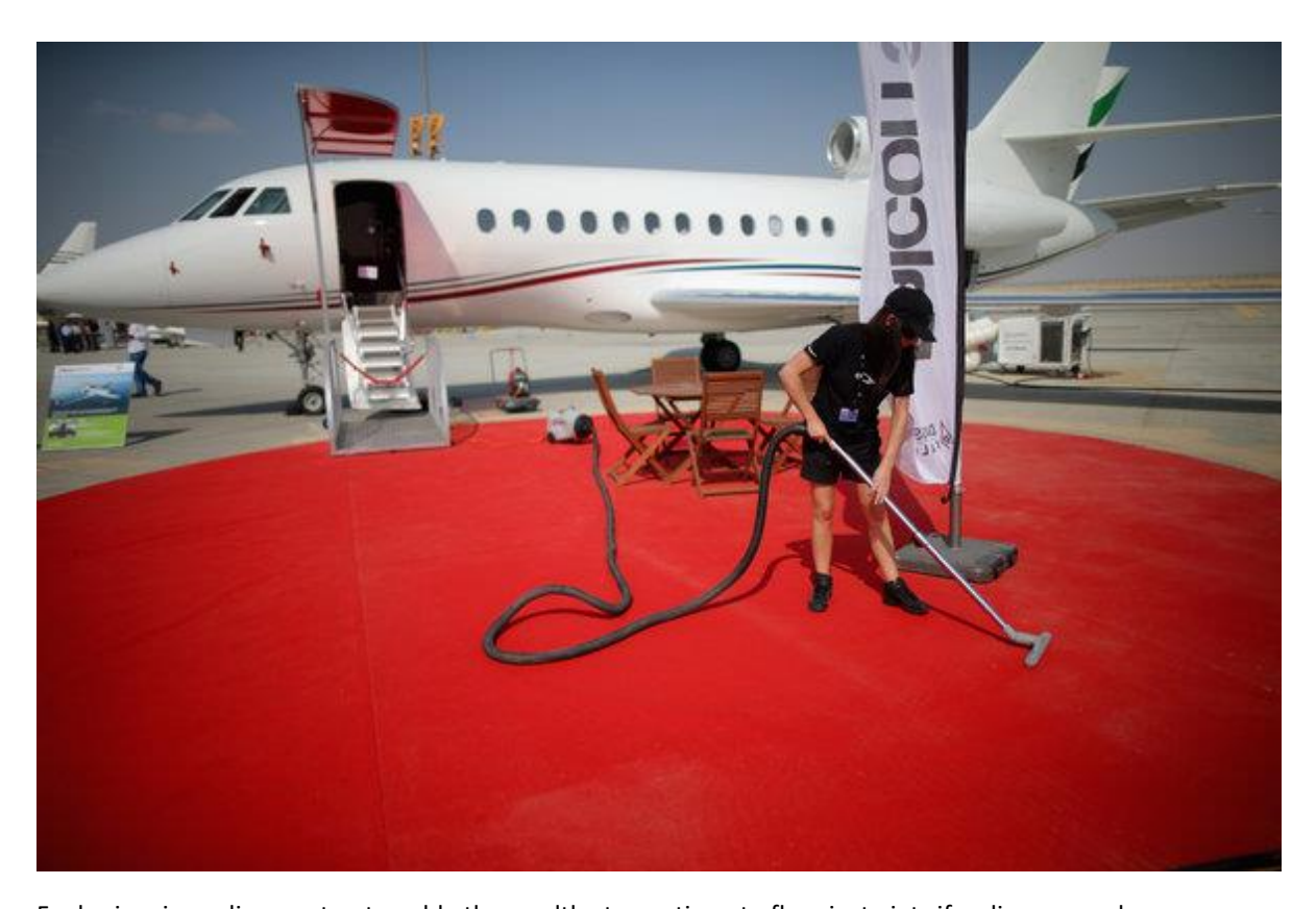
Fuel price rise policy must not enable the wealthy to continue to fly private jets if ordinary people can no longer afford the bus fare to work

If cycling is to become a serious transport option, we need infrastructure development for bicycles along commuter routes, not just in Hong Kong's recreational areas. A cycle highway along the entire front of Hong Kong Island and around the Kowloon peninsula are obvious starting points. Folding bike-friendly facilities on trains and buses should also be a component.